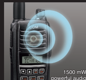
1500 mW powerful audio