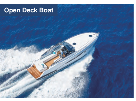
The waterproof CommandMic<sup>™</sup> can be used in open top areas even in rain or splash conditions.