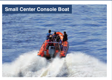
Stow the RF unit out of site and have only the CommandMic ^{\text{TM}} on the console panel.