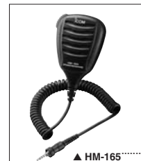
HM-165 SPEAKER-MICROPHONE Waterproof construction equivalent to IPX7 (1 m depth for 30 min.).