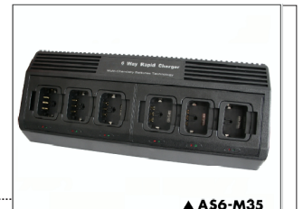
AS6-M35 5G-A'1' BATTERY CHARGER Charges the battery pack, BP-252, in 2 hours (approx.).

Please note : The noise cancellation can produce little or no effect in some conditions depending on type of noise, or the position and distance between the noise source and the microphone, etc. The noise cancellation does not work when an optional external speaker-microphone is connected.