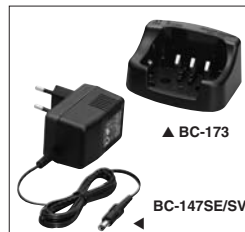
BC-173 DESKTOP CHARGER + BC-147SE/SV AC ADAPTER Charges the battery pack, BP-252, in 10 hours (approx.).