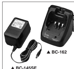
BC-162 DESKTOP CHARGER + BC-145SE AC ADAPTER Rapidly charges the battery pack, BP-252, in 2 hours (approx.).