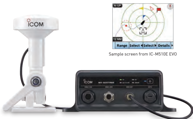
Sample screen from IC-M510E EVO